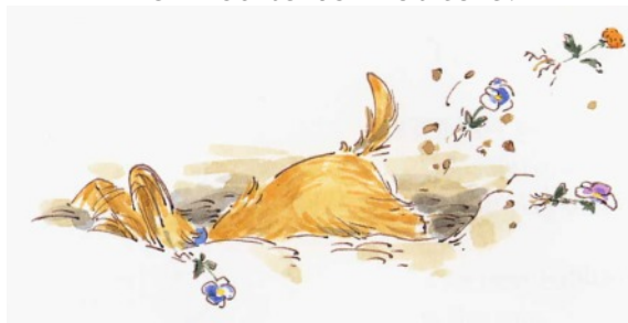
Little Dog is digging in the garden. Again!

Abbie had a little dog little dog little dog Abbie had a little dog who liked to bark at cars!